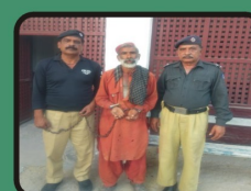
Railway material thief was nabbed