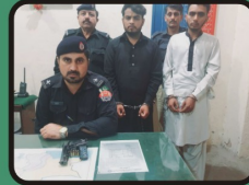
Couple of hard-core dacoits were held from railway premises