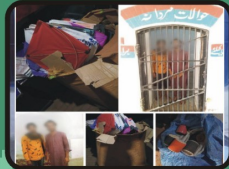
Two held from Attock city station passenger lounge and Jaffer Express train for transporting 850 kites and 50 string rolls