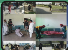
Mock drill was conducted in collaboration with Triple-1 Brigade of army at RS RWP