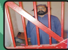
A court absconder was arrested and sent behind the bars