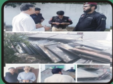
A station master was arrested who misappropriated 47 iron doors of railway