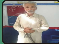
An accused was arrested who used to offer adulterated dates to the passengers in order to steal their belongings