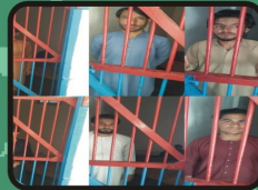
Six Afghan illegal immigrants were arrested