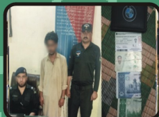
A pick pocket was arrested from the station with stolen amount, ATM cards and CNIC