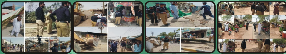
Railways land of worth Rs.107.4 million in toto was retrieved from land grabbers