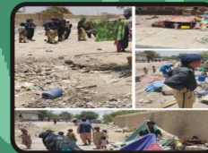
Railway land of worth Rs. 4.8 million was retrieved