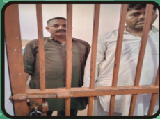
An alleged murderer was arrested and case was registered against him