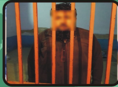
A railway servant was arrested for swindling the amount of tickets