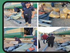
Non-custom 36 bundles of parachute cloth and 7 cartons of invertor were recovered