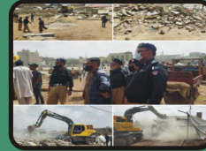
Railway land amounting Rs.135 million was retrieved in various anti encroachment operations