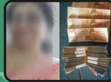
2.5 million rupees were recovered from widow of ex-deceased employee of railway