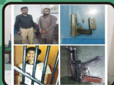
Unlicensed dagger and arms were recovered from the possession of passengers and cases were registered against them