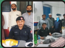
Drug-Peddlers were arrested from Peshawar Cantt station; 1.5 kg of narcotics was confiscated