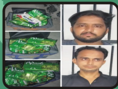
55 packets of injurious to health Gutka were recovered from passengers