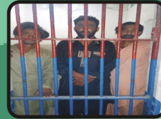
Dangerous gamblers were arrested from railway jurisdiction