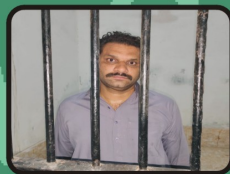
An accused was arrested who in the state of intoxication created ruckus in the platform