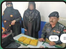
A lady passenger was arrested for transporting 3.5kg Hashish