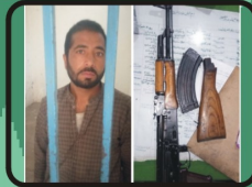
Prohibited Avtomat Kalashnikov-47 was recovered from a passenger