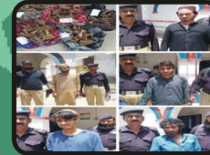
Railways material thieves were arrested from platform 1 of railway yard Peshawar city