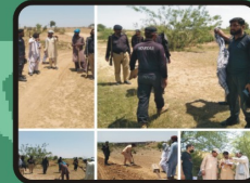
Security provided to railways administration during anti-encroachment operation